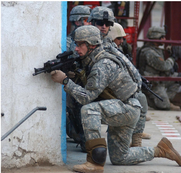
April 1, 2008.

Iraqi army soldiers and U.S. Army Soldiers from 2nd Battalion, 12th Artillery Regiment conduct a mission in Diyala, Iraq. The mission is designed to return displaced Iraqis to their homes.