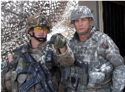
June 20, 2007

U.S. Army Soldiers halt during a patrol in Adhamiya, Iraq. The Soldiers are with Charlie Company, 1st Battalion, 26th Infantry Regiment, 1st Infantry Division.