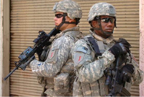
April 5, 2007

U.S. Army Soldiers with the 4th Brigade, 1st Infantry Division stand guard at a market in Al Doura in Baghdad, Iraq, providing security for Ryan Crocker, U.S. ambassador to Iraq.