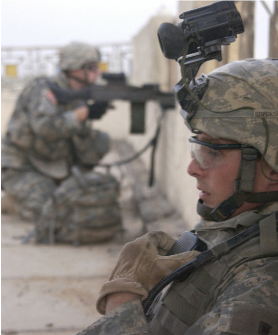
June 19, 2007