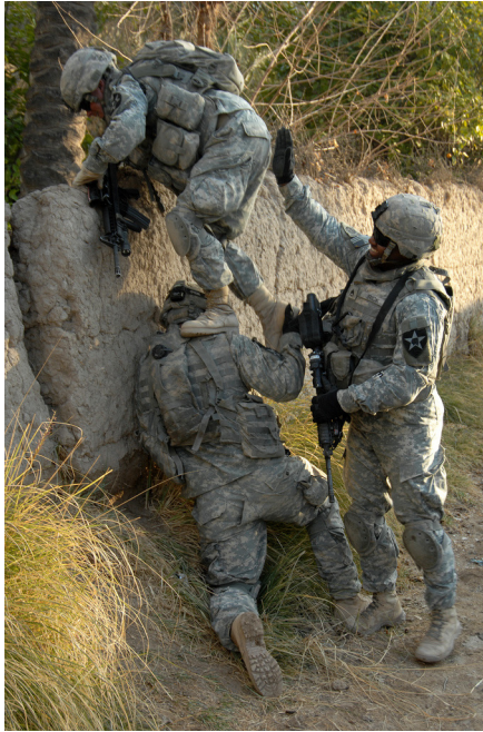
Feb. 13, 2008

U.S. Army Soldiers from 2nd Battalion, 12th Artillery Regiment conduct a mission in Diyala, Iraq. The mission is designed to return displaced Iraqis to their homes.