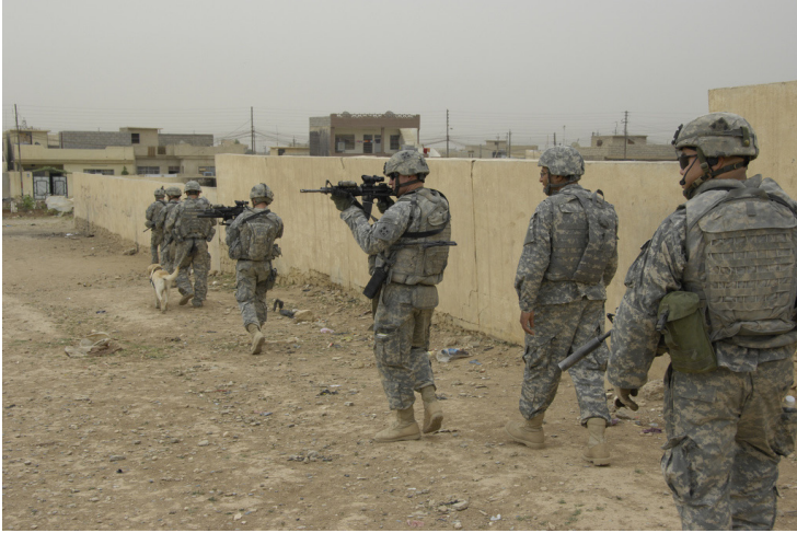
April 29, 2008

U.S. Soldiers from Delta Company, 1st Battalion, 8th Infantry Regiment provide security while a Soldier and his military working dog prepare to search for explosive devices in a school during aordon and search in the Intisar neighborhood of Mosul, Iraq.