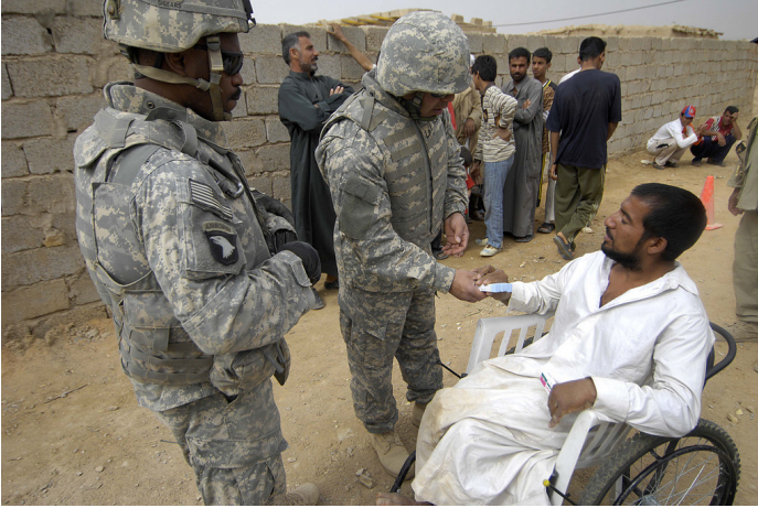
March 27, 2008

U.S. Army Soldiers from Alpha Battery, 1st Battalion, 10th Field Artillery, 3rd Infantry Division hand out supplies to villagers during a medical operation in Sabah Nissan, Iraq.