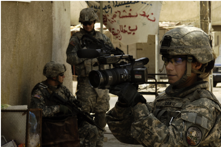
April 4, 2008

U.S. Soldiers from Delta Company, 1st Battalion, 8th Infantry Regiment provide security while a Soldier and his military working dog prepare to search for explosive devices in a school during aordon and search in the Intisar neighborhood of Mosul, Iraq.