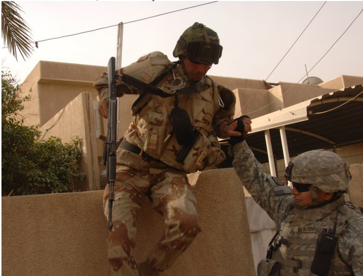
Feb. 24, 2008.

U.S. Army Soldiers and members of Sons of Iraq move to their next checkpoint during a checkpoint establishment operation in the Rashid district of Baghdad, Iraq. The Soldiers are from 2nd Squadron, 2nd Stryker Cavalry Regiment, 4th Infantry Brigade Combat Team, 1st Infantry Division.