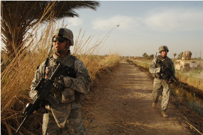
April 1, 2008.

U.S. Army Soldiers from Baker Company, 1st Battalion, 15th Infantry Regiment, 3rd Heavy Brigade Combat Team, 3rd Infantry Division cover each other as they scan for enemy personnel during a patrol through a village southeast of Salman Pak, Iraq. Al-Qaeda members had recently occupied the village so the Soldiers are working with sheiks in the area to improve security.