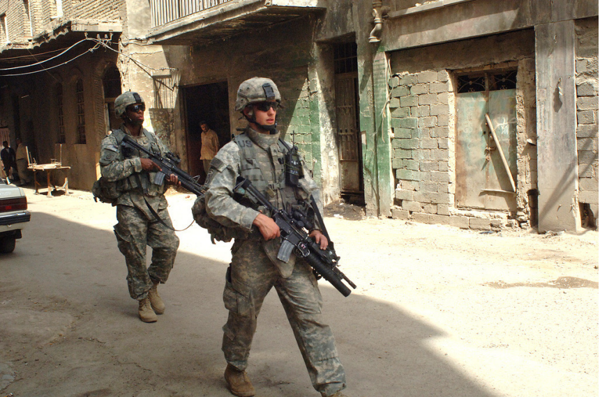
April 23, 2007

U.S. Army Soldiers from Headquarters and Headquarters Company, 1st Battalion, 504th Parachute Infantry Regiment, 1st Brigade Combat Team, 82nd Airborne Division provide security at the Abu Nuwas fish market area in the Rusafa security district in East Baghdad, Iraq. The Soldiers are providing security to revitalize the market area.