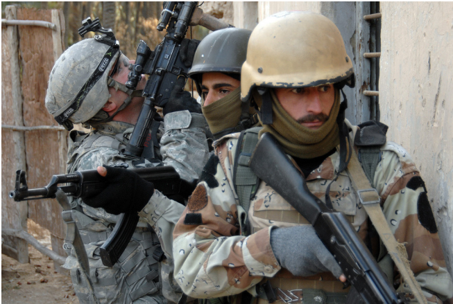
Feb. 13, 2008

Iraqi army soldiers and U.S. Army Soldiers from 2nd Battalion, 12th Artillery Regiment conduct a mission in Diyala, Iraq. The mission is designed to return displaced Iraqis to their homes.