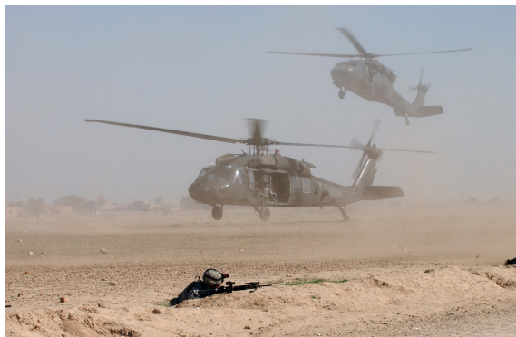
March 3, 2007

Two U.S. Army UH-60 Black Hawk helicopters blow up clouds of dust as they come into a landing zone in Samarra, Iraq, to pick up U.S. Army soldiers. The soldiers are from Delta Company, 3rd Battalion, 8th Cavalry Regiment, 1st Cavalry Division.