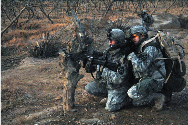
Feb. 10, 2008

U.S. Army Soldiers from 2nd Battalion, 12th Field Artillery Regiment conduct a clearing mission in Duwebb, Iraq.