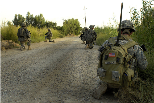
July 12, 2007.