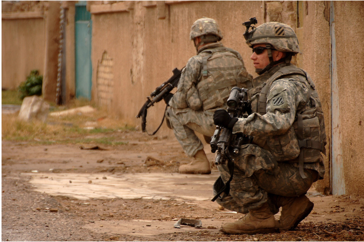
Feb. 15, 2008

U.S. Army Soldiers from Baker Company, 1st Battalion, 15th Infantry Regiment, 3rd Heavy Brigade Combat Team, 3rd Infantry Division scan for enemy personnel during a patrol through a village southeast of Salman Pak, Iraq. Al-Qaeda members had recently occupied the village so the Soldiers are working with sheiks in the area to improve security.