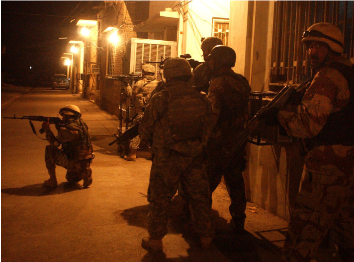
March 6, 2007

U.S. and Iraqi Soldiers clear the Baghdad neighborhood of Adhamiya. The U.S. Soldiers are from Company C, 1st Battalion, 26th Infantry Regiment.