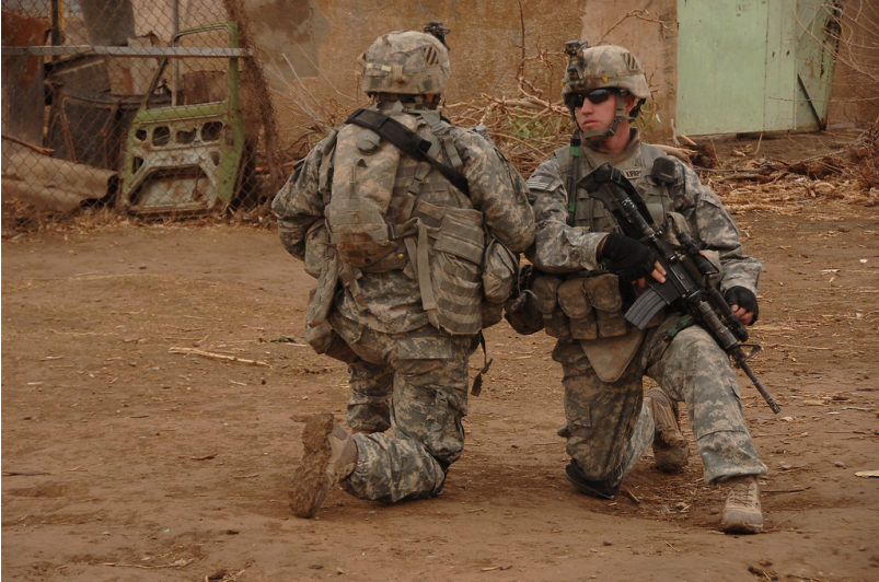
Feb. 15, 2008

U.S. Army Soldiers from Baker Company, 1st Battalion, 15th Infantry Regiment, 3rd Heavy Brigade Combat Team, 3rd Infantry Division cover each other as they scan for enemy personnel during a patrol through a village southeast of Salman Pak, Iraq. Al-Qaeda members had recently occupied the village so the Soldiers are working with sheiks in the area to improve security.