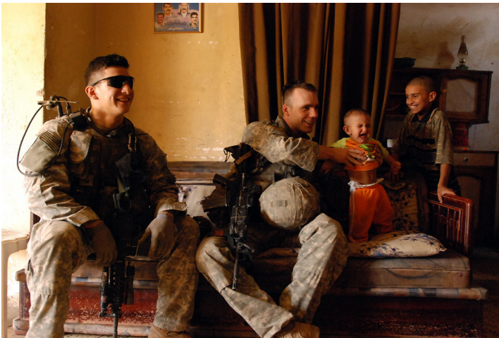
May 8, 2007