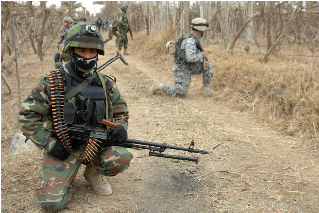
Feb. 8, 2008

U.S. Army Soldiers from Baker Company, 1st Battalion, 15th Infantry Regiment, 3rd Heavy Brigade Combat Team, 3rd Infantry Division scan for enemy personnel during a patrol through a village southeast of Salman Pak, Iraq. Al-Qaeda members had recently occupied the village so the Soldiers are working with sheiks in the area to improve security.