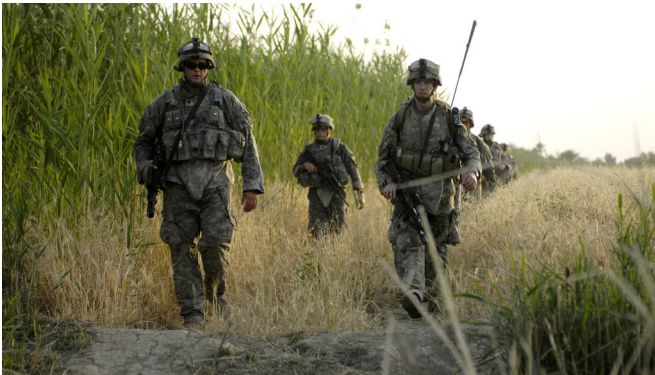
May 14, 2007

U.S. Army Soldiers from 2nd Battalion, 12th Artillery Regiment conduct a mission in Diyala, Iraq. The mission is designed to return displaced Iraqis to their homes.