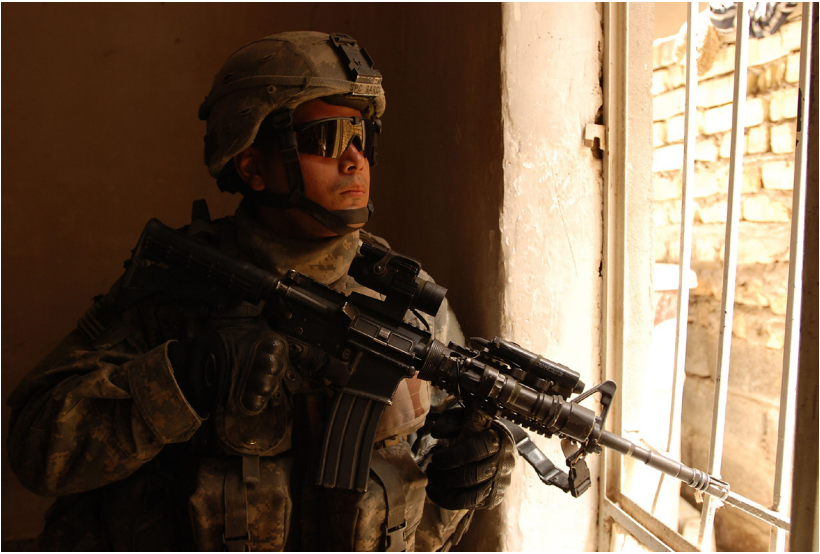
May 10, 2007