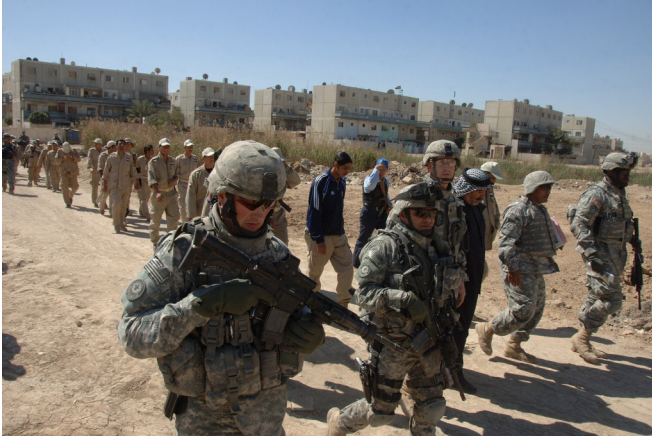
May 16, 2007

U.S. Army Soldiers and members of Sons of Iraq move to their next checkpoint during a checkpoint establishment operation in the Rashid district of Baghdad, Iraq. The Soldiers are from 2nd Squadron, 2nd Stryker Cavalry Regiment, 4th Infantry Brigade Combat Team, 1st Infantry Division.