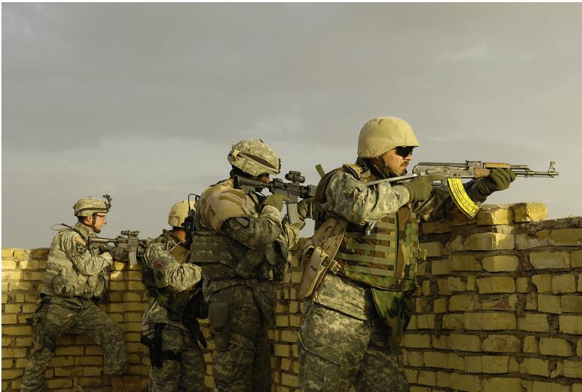
Feb. 26, 2007

U.S. Army Soldiers with the 4th Brigade, 1st Infantry Division stand guard at a market in Al Doura in Baghdad, Iraq, providing security for Ryan Crocker, U.S. ambassador to Iraq.