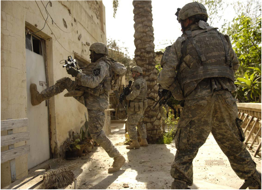
March 14, 2007

A U.S. Army Soldier from the 1st Stryker Brigade Combat Team kicks in the door of a building during a cordon and search in Buhriz, Iraq. Soldiers from the 5th Battalion, 3rd Brigade, 2nd Infantry Division are conducting their first mission in the Diyala province.