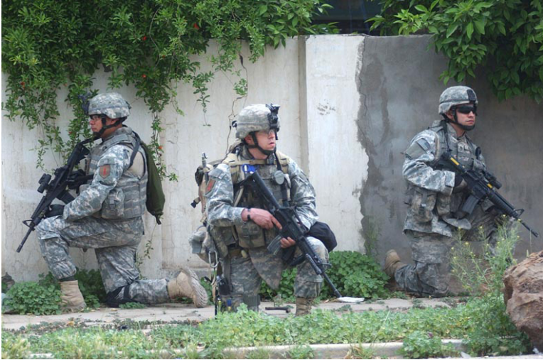
April 10, 2007

U.S. Army Soldiers halt during a patrol in Adhamiya, Iraq. The Soldiers are with Charlie Company, 1st Battalion, 26th Infantry Regiment, 1st Infantry Division.