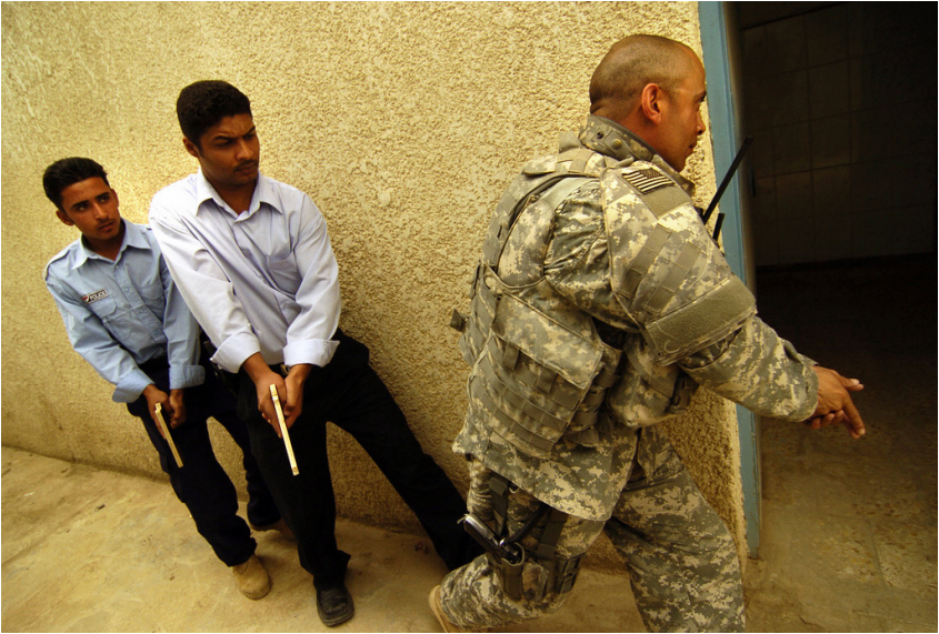
May 17, 2007

Iraqi policemen train on building clearing procedures with the a U.S. Army Soldier at the Tunis Iraqi police station in Hasua, Iraq. The training is being conducted by U.S. Army Soldiers with the 127th Military Police Company and international police advisors.