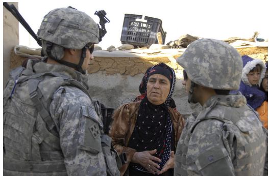
May 1, 2008

A U.S. Army Soldier from Delta Company, 1st Battalion, 8th Infantry Regiment, and a U.S. Army Interpreter, question an Iraqi Civilian at her home during a Cordon and Search in the town of Al Intisar, Mosul, Iraq, on. A Cordon and Search is conducted to find explosive paraphernalia and weapons. Local residents are questioned for information regarding Improvised Explosive Device placement in their town.