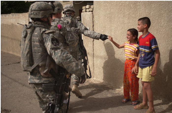
June 2, 2007

Iraqi policemen train on building clearing procedures with the a U.S. Army Soldier at the Tunis Iraqi police station in Hasua, Iraq. The training is being conducted by U.S. Army Soldiers with the 127th Military Police Company and international police advisors.