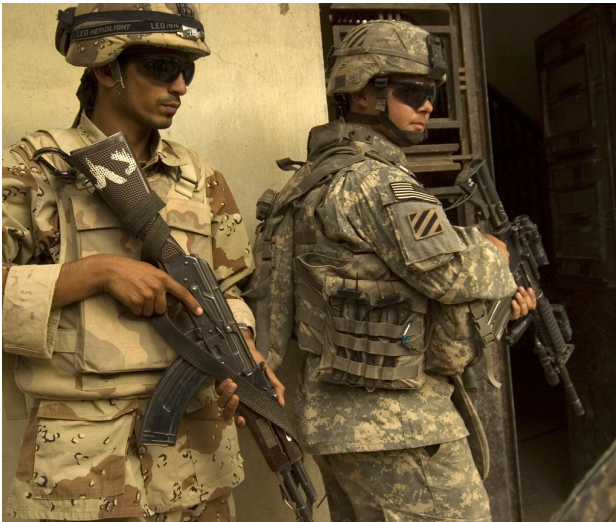
A U.S. Army Soldiers attached to the 4th Battalion, 31st Infantry Regiment searches for three missing Soldiers in Yusifiyah, Iraq.