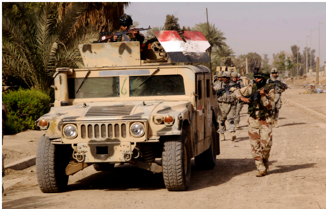
May 1, 2008

U.S. Army Soldiers from Alpha Battery, 1st Battalion, 10th Field Artillery, 3rd Infantry Division hand out supplies to villagers during a medical operation in Sabah Nissan, Iraq.