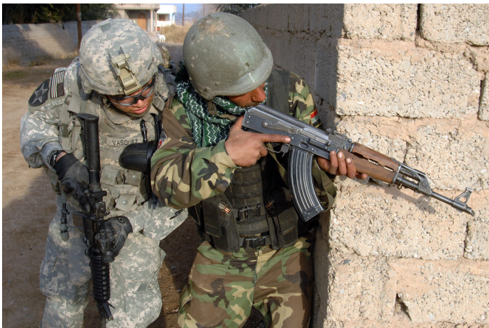
Feb. 10, 2008

U.S. Army Soldiers from 2nd Battalion, 12th Field Artillery Regiment conduct a clearing mission in Duwebb, Iraq.